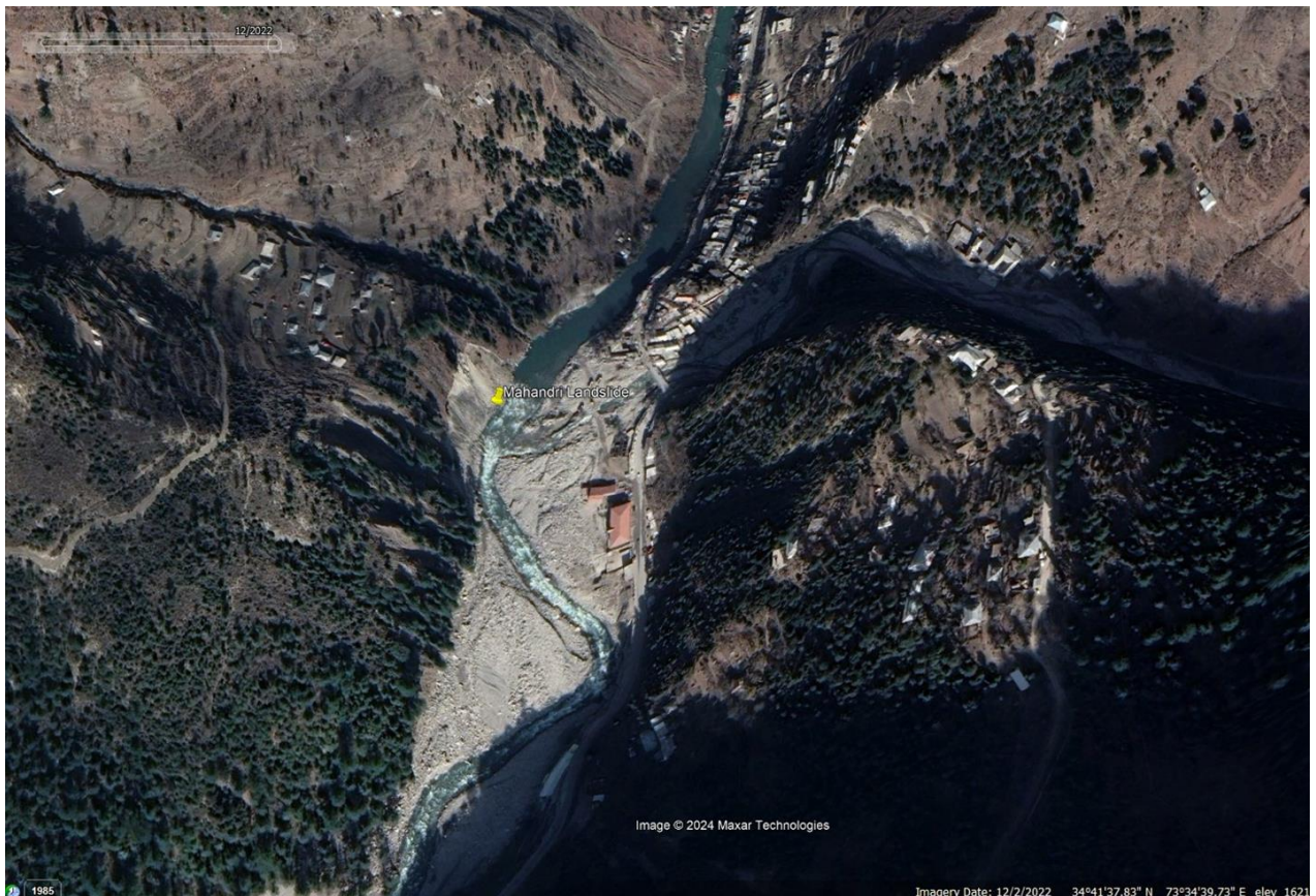
Figure 1 Mahandri Bazar